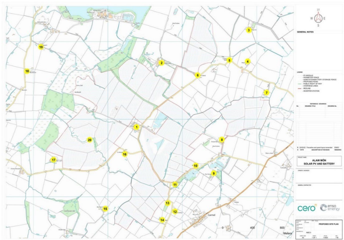
Figure 12.1: Receptor Locations

12.41 All considered receptors, with the exception of R20, are human/residential in nature, which represent the closest and most sensitive receptors to the Development.